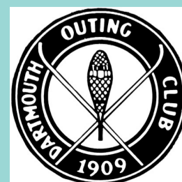
DARTMOUTH OUTING CLUB