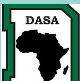
DARTMOUTH AFRICAN STUDENTS ASSOCIATION