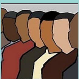
MEN OF COLOR ALLIANCE